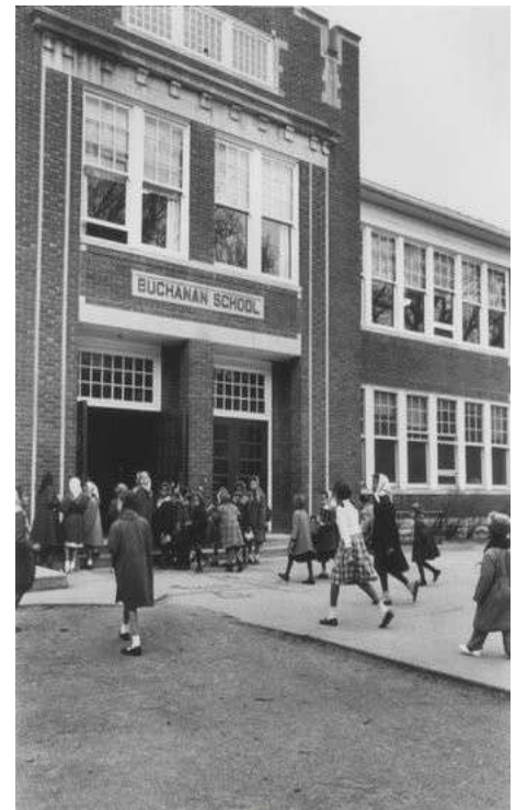
1950 - students attend Buchanan School 1982 - Buchanan School renovated for HCCI's office